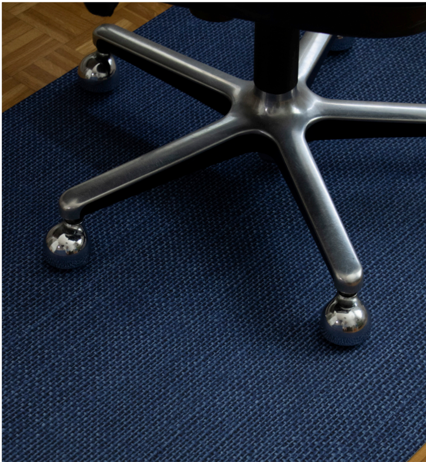
Product No. 32765